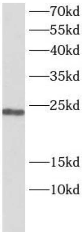
Hela cells were subjected to SDS PAGE followed by western blot with FNab10150(PTTG1 antibody) at dilution of 1:1000