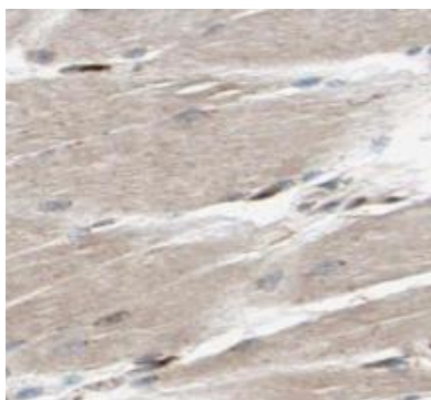
Immunohistochemistry of paraffin-embedded human skeletal muscle using FNab09542(XIRP2 antibody) at dilution of 1:50