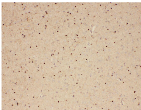
Immunohistochemistry of paraffin-embedded human brain using FNab09470(WASL antibody) at dilution of 1:50