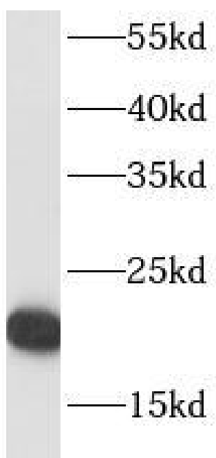
Jurkat cells were subjected to SDS PAGE followed by western blot with FNab07418(RPL18A antibody) at dilution of 1:500