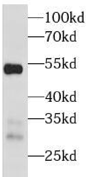
Rat liver tissue were subjected to SDS PAGE followed by western blot with FNab06967(PXR antibody) at dilution of 1:1000