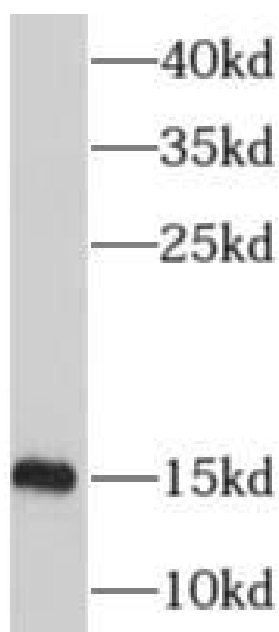
K-562 cells were subjected to SDS PAGE followed by western blot with FNab05345(MRPS12 antibody) at dilution of 1:500