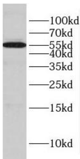
human lung tissue were subjected to SDS PAGE followed by western blot with FNab03510(GLYCTK antibody) at dilution of 1:400