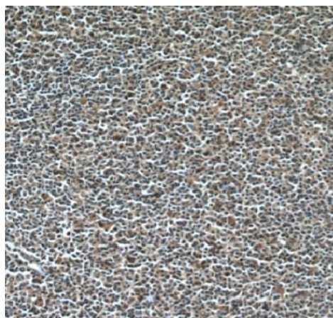
Immunohistochemistry of paraffin-embedded human tonsillitis tissue slide using FNab03382(GCET2 Antibody) at dilution of 1:50