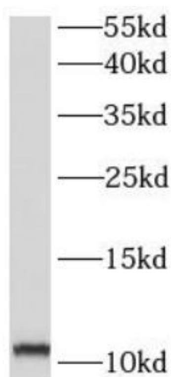
mouse heart tissue were subjected to SDS PAGE followed by western blot with FNab01905(COX6B2 antibody) at dilution of 1:100