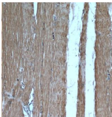
Immunohistochemistry of paraffin-embedded human pancreas cancer using FNab01234(CAMK2G antibody) at dilution of 1:100