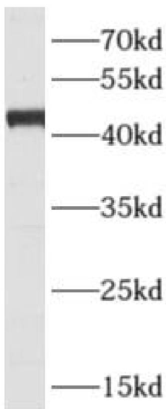
HeLa cells were subjected to SDS PAGE followed by western blot with FNab00539(ARFIP1 antibody) at dilution of 1:500