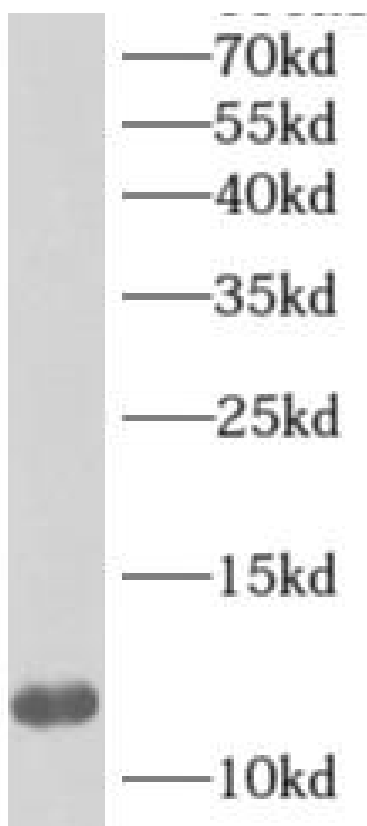
human plasma tissue were subjected to SDS PAGE followed by western blot with FNab00507(APOA2 antibody) at dilution of 1:1000